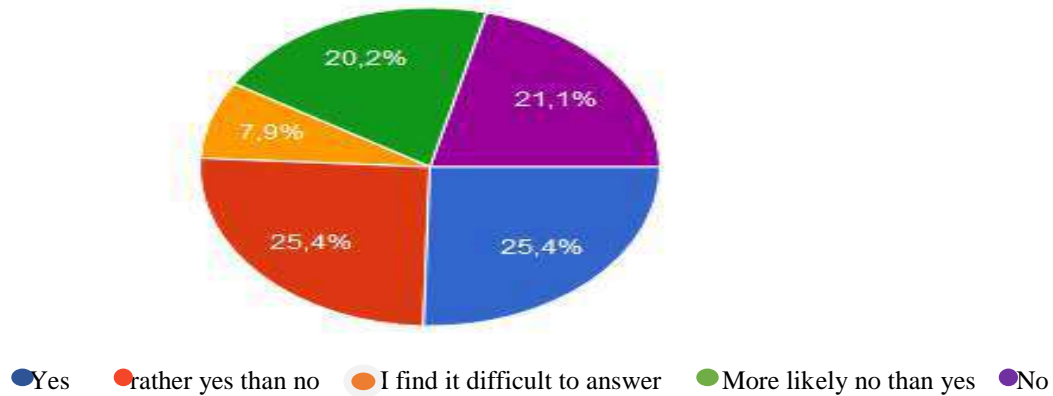
Figure 3. Demand for government programs to support SMEs

A comparison of the dynamics of production of small enterprises and loans issued to these enterprises showed that loans are not the main factor in the growth of production in this sector of the economy. From a logical point of view, the status of a company is influenced not by the amount of the loan, but by the effective demand for the goods and services that it produces. In addition, the lack of funds from consumers not only reduces the incomes of producers, but also reduces confidence in the latter. The demand for solvents can be provided by the economy in two ways: with the help of financial resources from abroad or by increasing the amount of value added generated by this economy. In addition, representatives of small and medium-sized businesses were asked if they would borrow money to start a business without a government program to support small and medium-sized businesses. The following answer is given (Fig. 3).