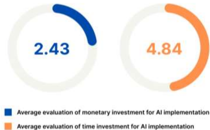
Figure 3.0 Average evaluation of investments in AI implementation based on survey