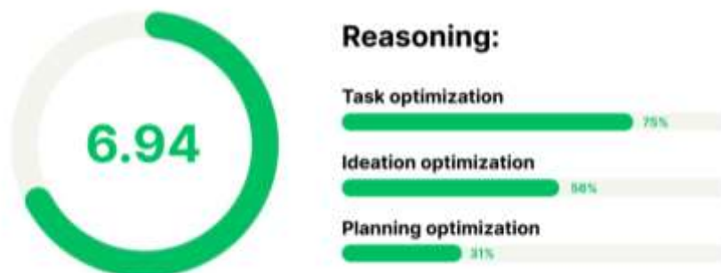
Figure 2.0 Average evaluation of AI effectiveness in small businesses based on survey

AI may also increase productivity by optimizing operations. Small firms may make modifications and improve their operations by using AI to discover inefficiencies and bottlenecks in their processes. AI, for instance, may support supply chain management by optimizing inventory levels and forecasting demand. According to research by Accenture, AI can boost small enterprises' productivity by up to 40%.