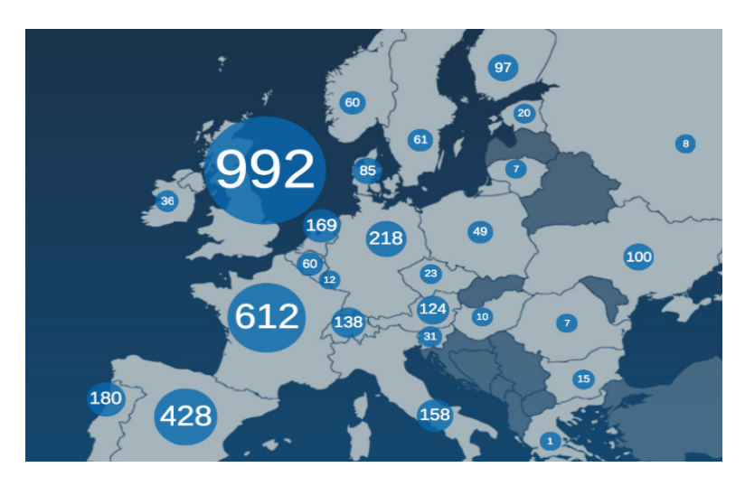
Figure 2. Start-ups in Europe that received accelerator investments (Gust, 2016)

Germany focused on high quality pharmaceuticals, automobile and telecommunication. The government has realized the importance of supporting start-ups and different initiatives have been set up to support this sector into growth. The Digital Economy Action Programme has been put up to give support by the German government. D'Avino states that, «governments around the world have amended regulation and created incentives to encourage development of start-ups» [6]. Rispers and Troger state how the German start-up centers are Berlin, Munich and Harmburg. Founders have been known to move to Munich and Stockholm due to access to capital and talent [13]. As presented in Fig. 2 on the Average Age of Start-ups, it is evident that Belgium and Sweden are the best ecosystems for start-ups with the average age of start-ups being 5.3 years for Sweden and 3.7 years for Belgium followed by Spain at 3.8 years. Romania is at the lowest at 1.3 and Czech at 1.8 years. This explains the technological start-up environment in Europe. The UK received the highest investment of more than 15.5 million Euros for 992 start-ups followed by Spain and Germany. Almost half (47 %) of these investments in Europe were made equity-free, meaning without any dilution of ownership.