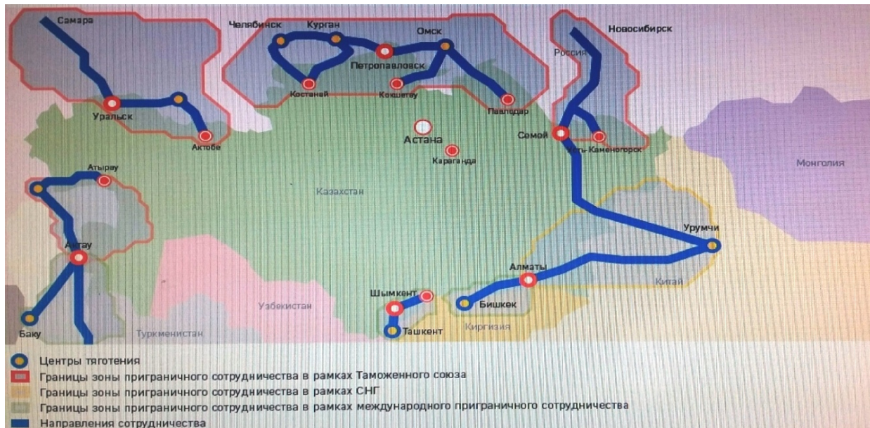
Figure 1. Scheme of border cooperation of Russia and Kazakhstan

The border-zone of Russia and Kazakhstan is presented by 12 Russian and 7 Kazakhstani regions which located along one of the most extended in the world, overland borders of two states — more than 7 thousand kilometers. Over 30 % of the population of Kazakhstan and 18,5 % of the population of Russia (in total more than 32 million people) live in the border areas of Russia and Kazakhstan. In Figure 1 the scheme of border cooperation of Russia and Kazakhstan is presented where the directions of cooperation and border of zones of border cooperation are separately highlighted.